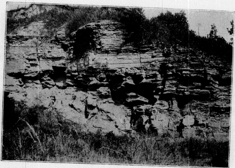
Figure 2. View of an outcrop of the lower portion of the Cedar Valley limestone along Mill Creek, Rock Island county, Illinois; the lowest block in the right-hand corner is the top of the Phillipsastrea ozne , which marks the uppermost layer of the Wapsipinicon stage.