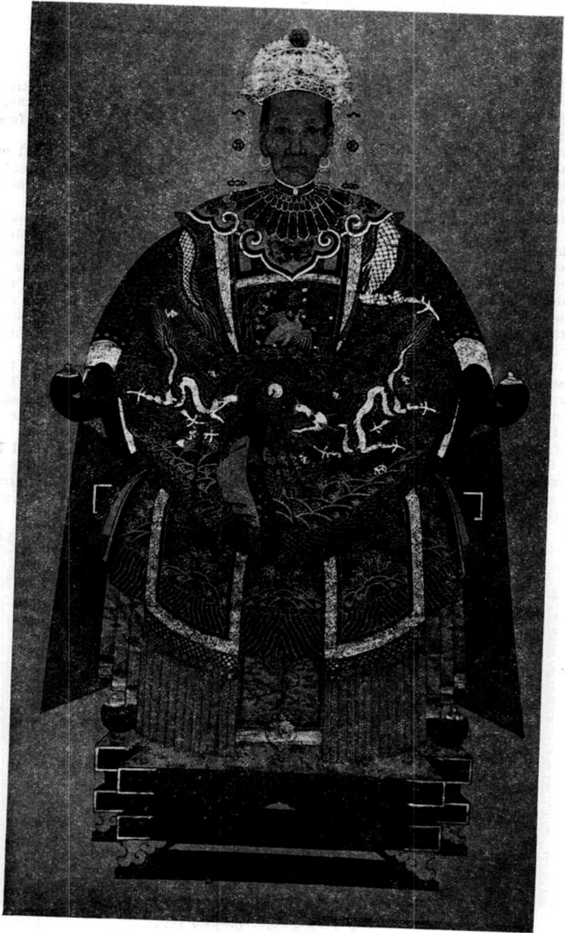
Fig. 3. Chinese Ancestral Portrait.