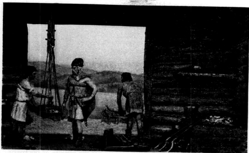
Fig. 2. Diorama: Merchant Venturers in Bronze.