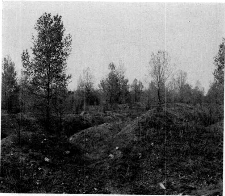
FIG. 2.—Striplands in Perry County, Illinois, about 21 years old.

meter quadrats, were taken at irregularly spaced points in each study division. The numbers of stems of each species of plant were determined for every quadrat, and the quadrat's position relative to spoil banks ( i.e. , whether on a ridgetop, in a valley, or on a northern, southern, eastern, or western slope) was recorded. In all, 310 square meters were examined.